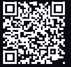
TRB245 360° VIEW

//LTE Cat 4 Industrial Gateway provides all essential features for any industry: fast and reliable Internet connection, combination of Ethernet and serial communication, secure power connection, I/O ports and time synchronization services.